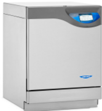
412001000 Freestanding FlaskScrubber Pictured